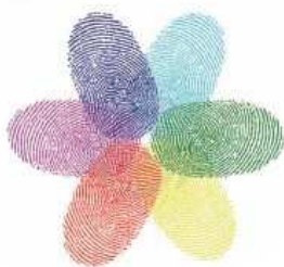
WPPL Unique DNA

■ Operators underwent a training on "Welding defects and Safety precautions during welding" The training covered importance of orientation, gun position, and operators hand. Problems during radius welding & their remedies, Operators safety during the welding operation.