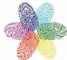
WPPL Unique DNA